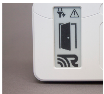
Full zone and system status display with customizable logo.