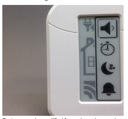
Features can be modified for each arming session. The settings remain static between arming, and can vary between HeliPADs on the system.