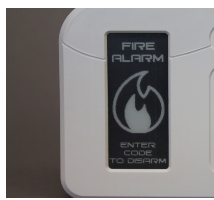
Clear alarm notification.